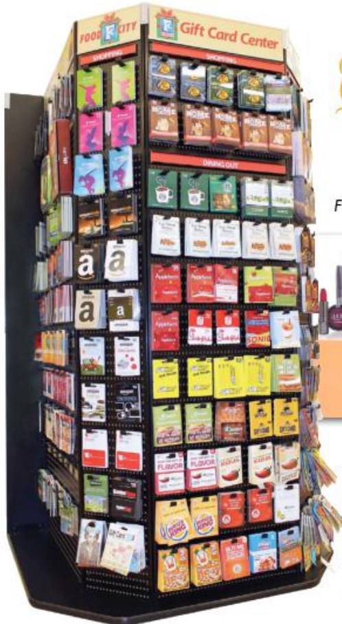
LOOK FOR OUR GIFT CARD DISPLAY